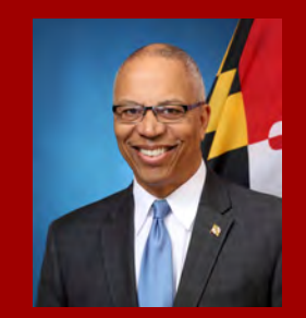
Boyd Rutherford Lt. Governor