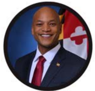
Governor Wes Moore

Working at the pleasure of the Moore/Miller Administration as they say, 'leave no one behind.'