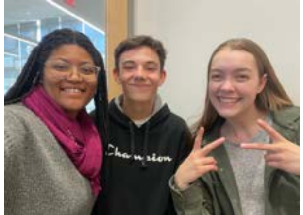
ID: Three smiling people pose closely together at the Laurel Branch Library.

Upcoming sessions will be offered virtually on Tuesday, March 10, 2026, and in person on Saturday, March 14, 2026, in Laurel. For additional information or to express interest, please contact gov.odhh@maryland.gov .