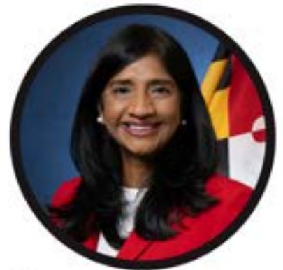
Lieutenant Governor Aruna Miller