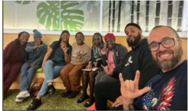
ID: Eight people sitting on a yellow couch at the library, five are holding up the ASL sign for “love.”

The Study Table offers interpreters an opportunity to exchange notes, collaborate, and support one another in preparation for the certification exam.