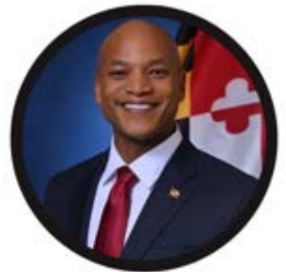
Governor Wes Moore

Working at the pleasure of the Moore/Miller Administration as they say, 'leave no one behind.'