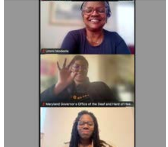
ID: A photo of four black women smiling in a Zoom Meeting.

Study Tables offer interpreters an opportunity to exchange notes, collaborate, and support one another in preparation for the certification exam.