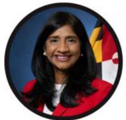
Lieutenant Governor Aruna Miller