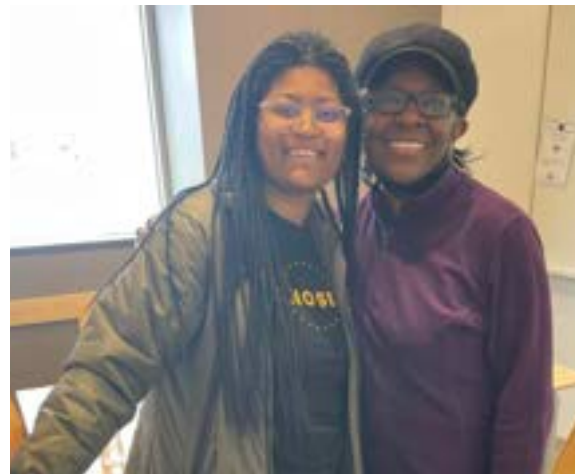
ID: A photo of two women standing and smiling at the camera.

Upcoming sessions will be held virtually on Tuesday, April 7, 2026, and in person on Saturday, April 11, 2026, in Laurel. If interested and/or have any questions or concerns email gov.oddh@maryland.gov .