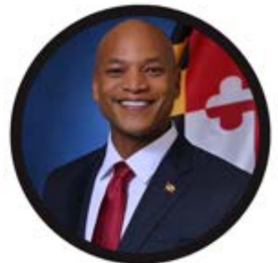
Governor Wes Moore

Working at the pleasure of the Moore/Miller Administration as they say, 'leave no one behind.'